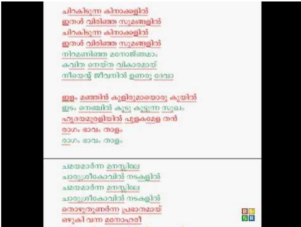
Snow Bros 2 Rar Password